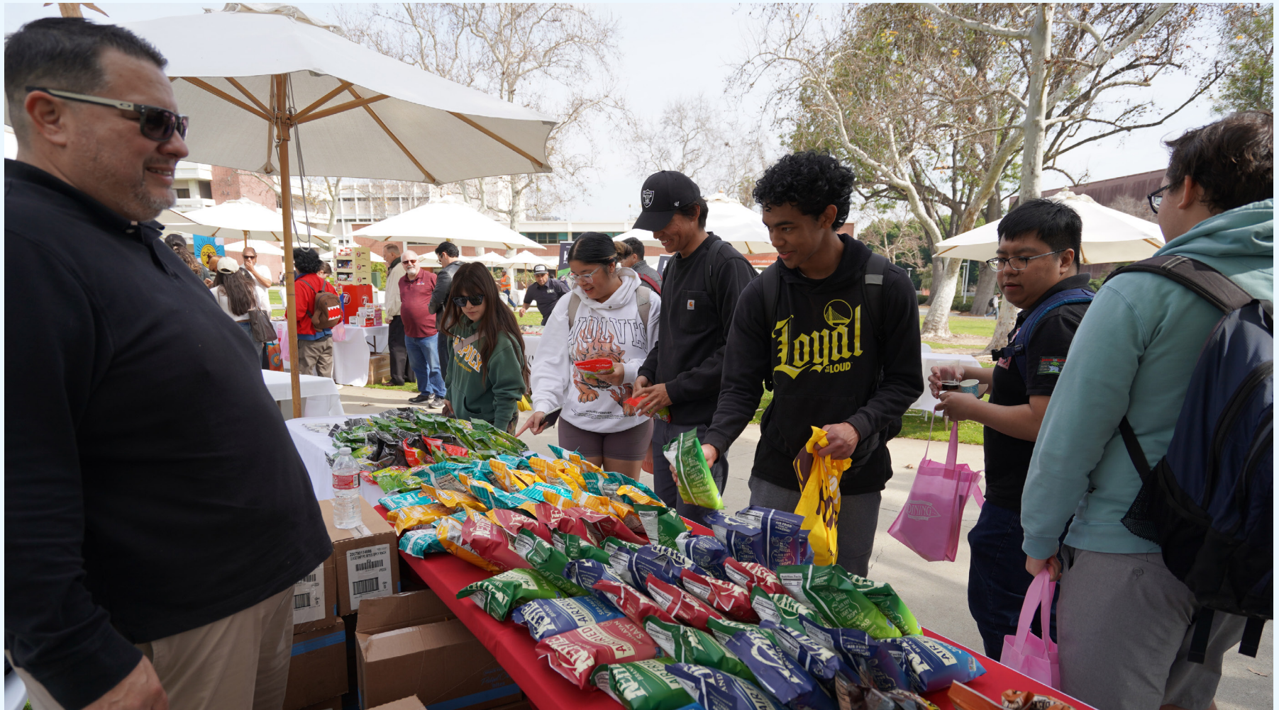
CPPE DINING SERVICES EXPO SEE PG. 12